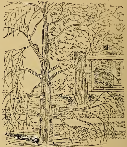
OUR FUTURE HOME.

Among other tropical fruits and vegetables, we found many acres of Yum-yums, and several fine specimens of Jym-Jams. The latter had always been